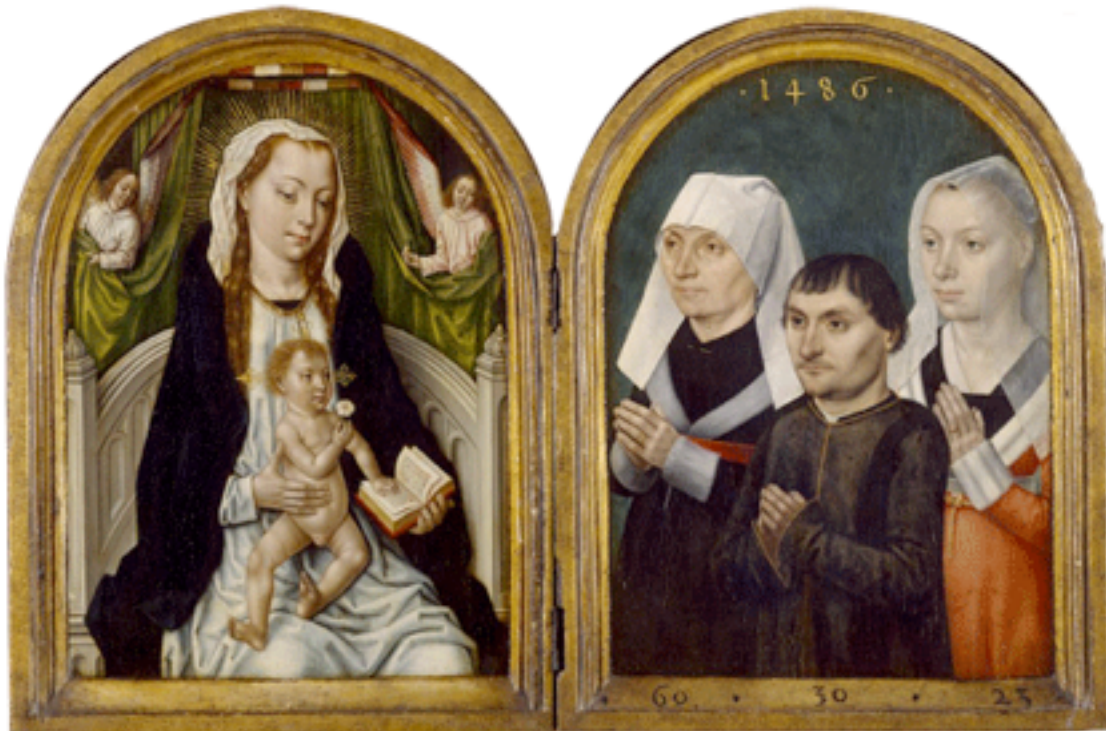
Master of the Saint Ursula Legend Flemish, active c. 1470—c. 1500 Virgin and Child (left) , 1486, oil on panel 28 x 21 cm (11 x 8 1/4 in.) Three Donors (right), 1486, oil on panel 28 x 21 cm (11 x 8 1/4 in.)

Here are some examples. One is from Ethiopia, showing a different style of painting but still revolving around Jesus and the story of Christianity.