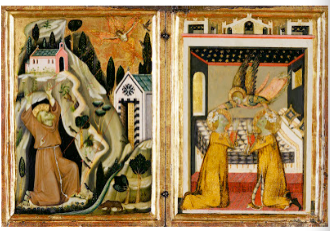
French, 14th century