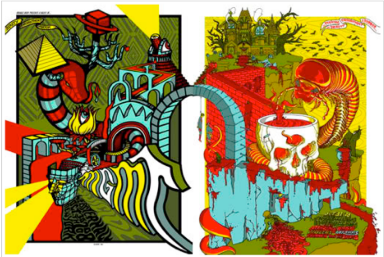
MGMT halloween poster